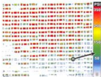
Figure 4: Pressurex film revealed the uneven distribution of pressure across the press plates.

After the pressing operation, when we examined Pressurex, the film had changed different intensities of color, with the color change directly proportional to the actual pressure applied. SB Electronics was able to determine the precise pressure magnitude by comparing the color intensity to a color correlation chart (conceptually similar to interpreting Ultras paper). We could visually inspect Pressurex and prove the press plates weren't flat and were causing uneven pressure distribution.