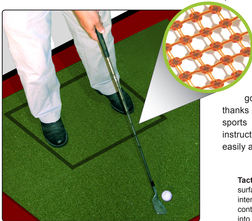
Golf swing assessment sensor element

Professional golfers and instructors know that the distribution of weight and balance are key components of power in a swing. They realize that speed and power come from the lower body and not just the hands and the arms, but they lacked one vital tool to help them take action to shift their body weight. Now the balance of a golfer's feet as it goes through a swing can be revealed and quantified thanks to the Tactilus®. This technology gives suppliers of sports motion analysis systems, golf club manufacturers, instructors and others in the industry the tools they need to easily analyze these important swing dynamics.